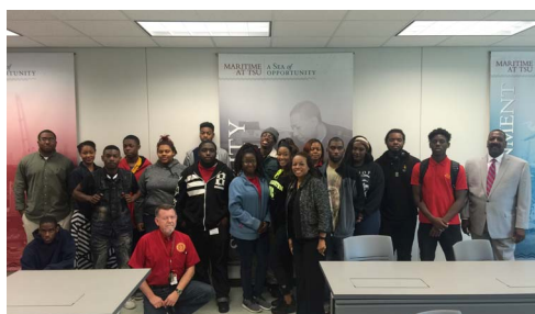
Students from Jack Yates High School in the Transportation Studies Department

Senior Students from the Jack Yates High School Maritime program visited the TSU Department of Transportation Studies on January 21, 2016. The purpose of the visit was to get Yates students interested in pursuing a Bachelor of Science degree in Maritime Transportation Management and Security (MTMS) at TSU. During the visit, the students learned about