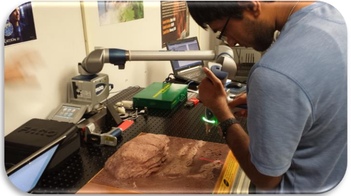
Creating a 3d model using laser scanning technology