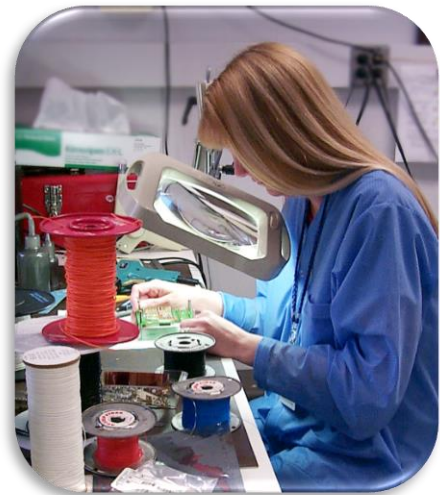
Performing final inspection on an electrical card

For more information about NASA Goddard Space Flight Center visit our website: http://www.nasa.gov/centers/goddard/home/index.html