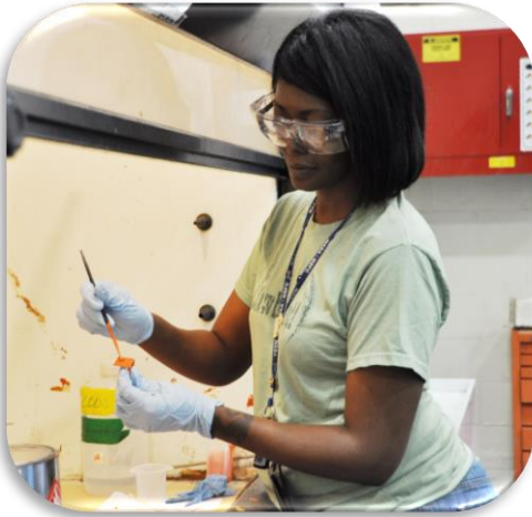
Masking a component surface